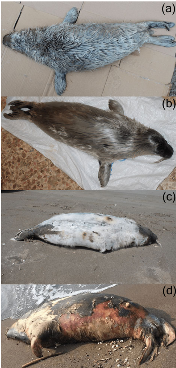
PLATE 1 Caspian seal Pusa caspica pups (a–d: 1st–4th pups, respectively; Table 1) from the southern Caspian Sea.

congested lungs, indicating the pups had died of suffocation and drowning. The cause of death of the third and fourth pups could not be determined as the carcasses were decomposing and were not necropsied (Table 1). In 37 interview surveys with experienced fishermen, two previous observations of live pups in Iranian waters were recorded: a female and her pup in Amirabad (36.850528° N, 53.328424° E; location 6, Fig. 1) in Mazandaran province during the winter of 1988, and a pup with white lanugo coat near fishing nets between Ghorogh (37.836111° N, 48.974167° E; location 1, Fig. 1) and Rudsar in Gilan province during the winter of 1999.