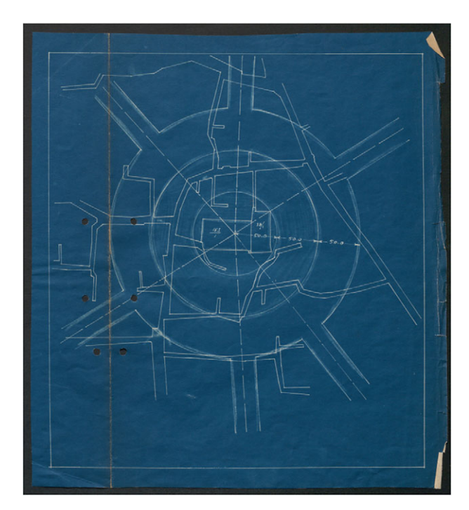
Figure 3. Blueprint of a section of the town planning scheme showing the House of Baha'u'llah at the center of a new public park.