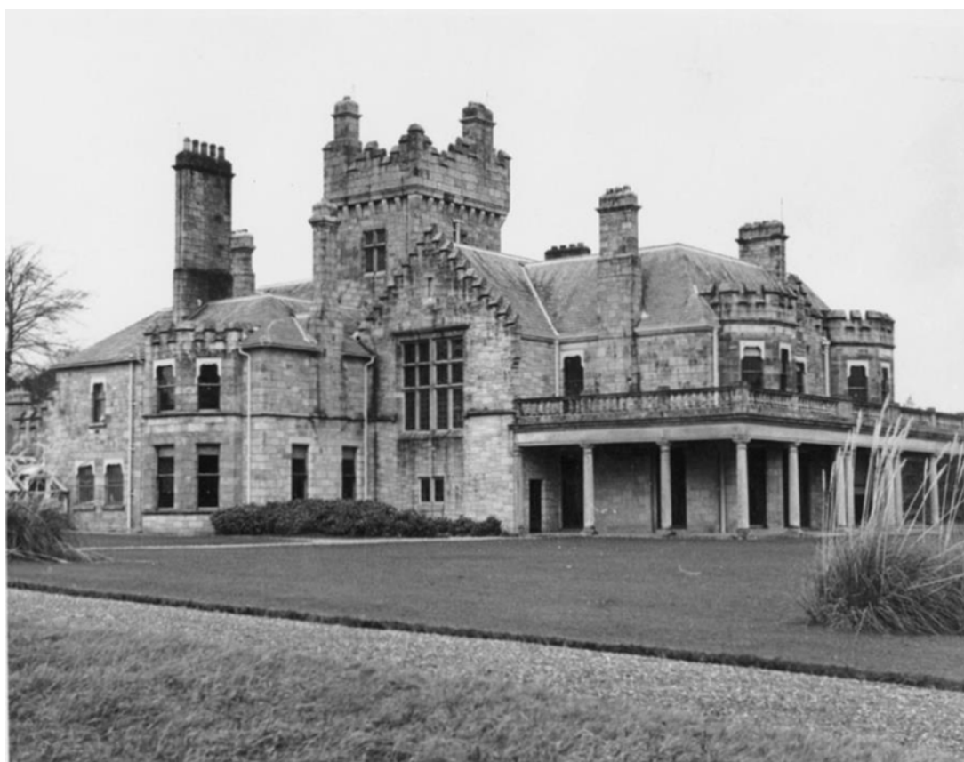
Figure 2. Glencairn Castle.