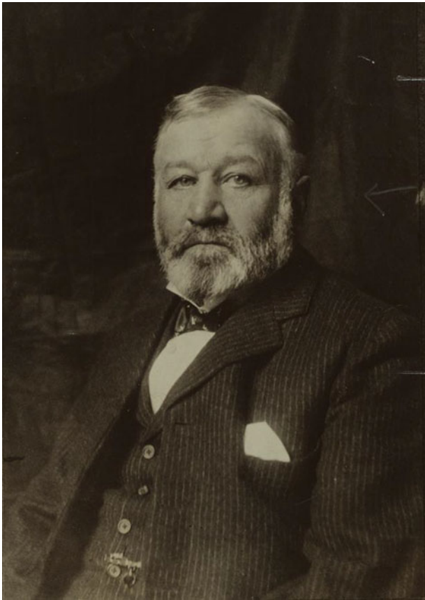
Figure 1. Richard Croker of Tammany Hall.

When Boss Croker mounted a public defense of Tammany Hall, he did so on very different grounds than invocation of commercial self-interest. Writing in the North American Review , a fashionable literary magazine, Croker explained that his organization worked to preserve the values of hierarchy, order, and loyalty within a “system of deferential compromise.” 6 How could Tammany be so vilified in the court of respectable opinion, Croker supposed, when clientelism was a cherished tradition deeply embedded within the country’s own representative institutions? The magazine’s Gilded Age society audience might have hemmed and hawed, as Protestant U.S.-born middle-class readers wary of Tammany’s working-class, Catholic and immigrant electorate. But many contemporaries, beginning with elite reformers, conceded Croker’s basic point about historical legacy.