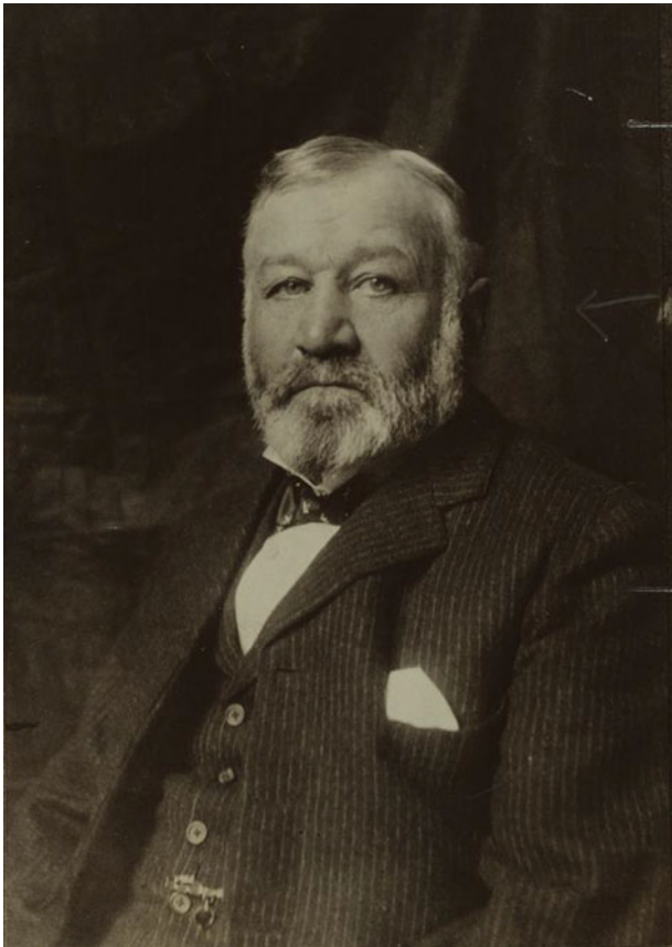
Figure 1. Richard Croker of Tammany Hall.