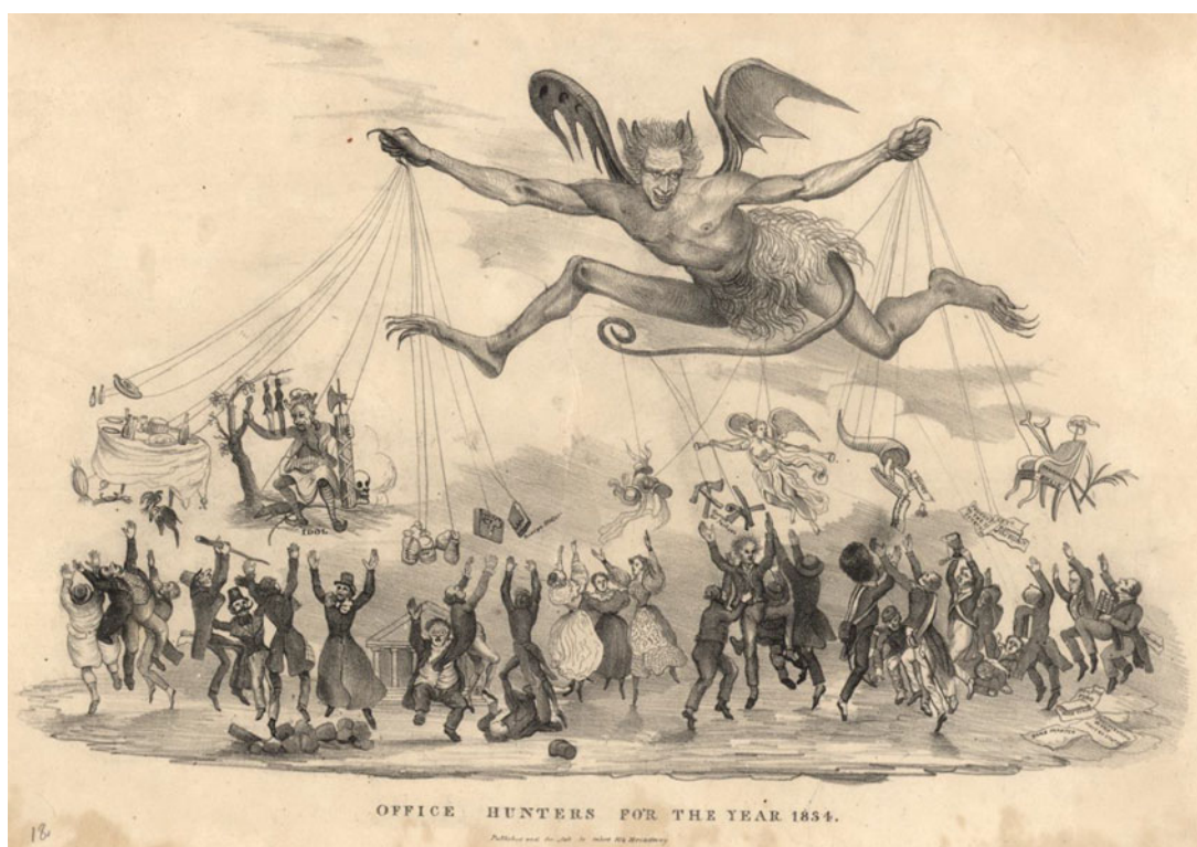
Figure 4. Office Hunters for the Year 1834.