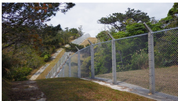
High fence surrounding storage area (2014 photograph)

Meanwhile, after-effects of the base persist. Three Army veterans of the 137th from the