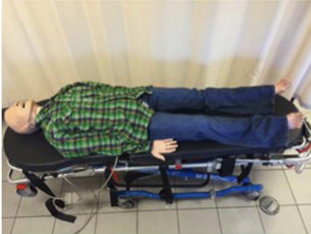
Figure 2. Dressed mannequin.

(SD 7.5) between cutting techniques. We estimated that a total of 24 participants (8 in each group) would provide 92% power to detect half the clinically significant difference. The clinically significant difference was determined by a focus group of 10 experts in emergency medical services across Canada. Participants were evaluated using a per-protocol analysis. Unadjusted analyses using a one-way ANOVA were performed to look for a difference among techniques with regard to total time to patient exposure as well as differences in time to remove a specific item of clothing. Further differences between specific groups in both total time-to-exposure as well as individual pieces of clothing were determined post hoc using Tukey's pairwise comparisons. All analyses were conducted using Minitab 17 (Minitab Inc., State College, PA).