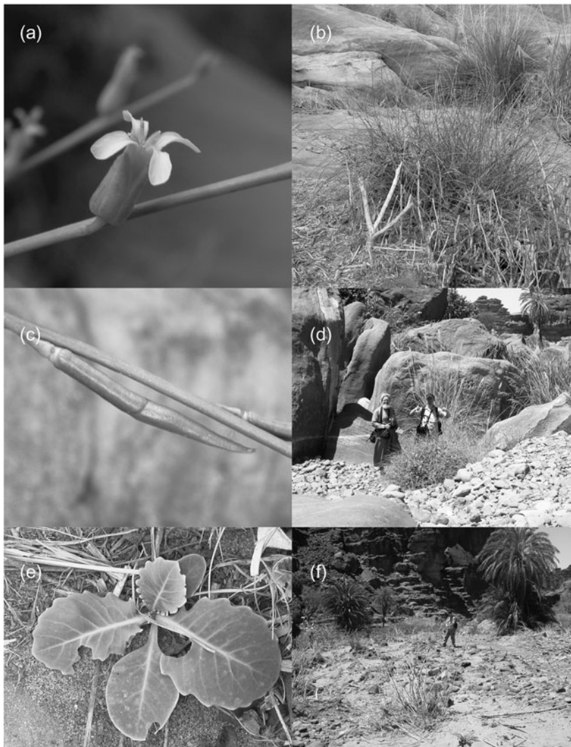
PLATE 1 Douepea arabica and its habitat: (a) flower, (b) habit, (c) immature fruits, (d) in Wadi Ghamrah on Jibal Qaraqir (Fig. 1), (e) seedling and (f) wadi bed habitat of seedlings and mature individuals.

in the Royal Botanic Garden Edinburgh herbarium) of D. arabica from Wadi Qaraqir state that it was locally common at c. 600 m. Our surveys in this locality only recorded a single plant, at a similar altitude. A survey of the nearby and less accessible Wadi Ghamrah revealed nine mature plants at a single site in the wadi bed together with > 30 seedlings, also at c. 600 m. At this newly recorded locality D. arabica appeared to be actively regenerating in habitats similar to those of Wadi Qaraqir, i.e. near to seepages and springs; no plants were recorded on the drier slopes. One individual was found growing above a spring in the sandy soils of the wadi channel, among red sandstone rocks. Others were in the wadi channel, among boulders or in sand. As in Wadi Qaraqir the dominant vegetation of Wadi Ghamrah is Nerium oleander L. shrubland with large stands of Phragmites , Typha and Pennisetum divisum (J.F. Gmel.) Henrard. In the vicinity of Wadi Qaraqir and Wadi Ghamrah there are a number of narrow wadi valleys that also hold perennial springs and seepages, such as Wadi Amdan and