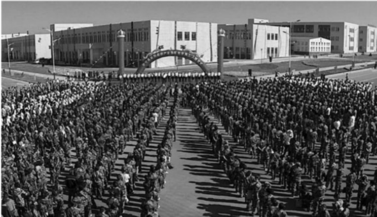
Figure 2. On 15 August 2017, 1,805 “Surplus” Minority Herders and Farmers Entered the New Industrial Park and “Put on Leather Shoes” to Become Industrial Workers

Notes: Image location in area of black box pictured in Figure 1 .