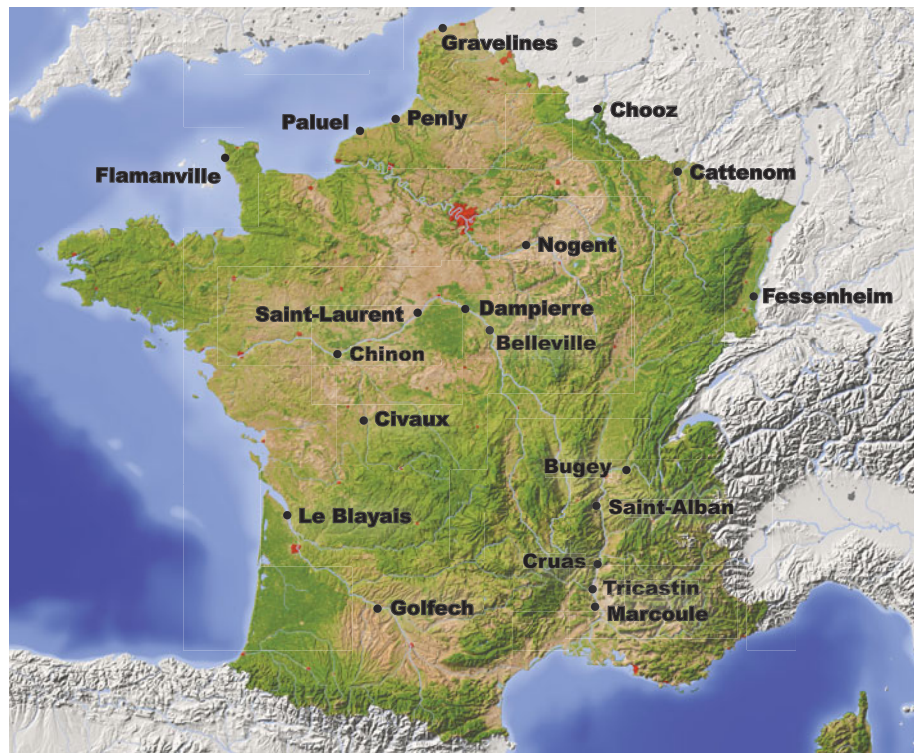
Locations of nuclear power plants in France, as of January 2011.

The French government elected from the outset to reprocess used fuel to recover uranium and plutonium, thereby reducing the amount of high-level waste that needs disposal. About 20% of the electricity produced by EdF comes from recycled fuel. But nuclear waste management has not had a smooth ride even in France. Despite the generally positive