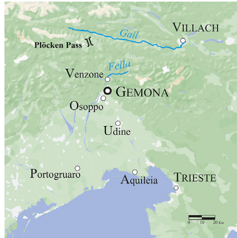
Figure 1. Gemona and the Alpine trade routes.

Emperor Conrad III of Germany stayed in Gemona with his court on his way back from the Holy Land, showing that the town was then already a major Alpine region hub (Figure 1). 10