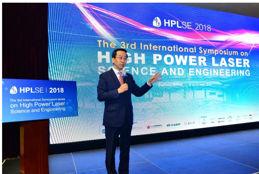
Dr. Jie Zhang was giving a talk at the conference HPLSE 2018

Dr. Jie Zhang, a distinguished physicist, has made significant contributions in the fields of high-energy density physics and inertial confinement fusion. Because of these, he was elected academician of the Chinese Academy of Sciences in 2003, academician of the German National Academy of Sciences in 2007, Fellow of the Academy of Sciences for the Developing World (TWAS) in 2008, foreign member of the Royal Academy of Engineering in the United Kingdom in 2011, and foreign associate of the National Academy of Sciences in the United States in 2012. In 2015, he was awarded the prestigious Edward Teller Medal, the most important international award in inertial confinement fusion and high-energy density physics. In 2021, he was awarded the Future Science Prize in Physical Sciences.