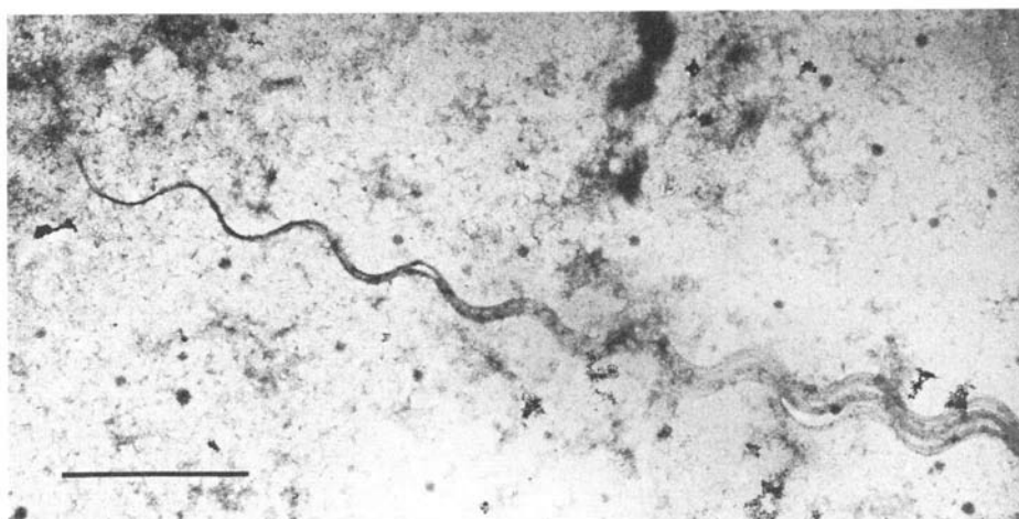
Fig. 2. Transmission electron micrograph of detail of spirochaete-like object showing fibre-like composition. Bar = 5 \mu\text{m} .

DNA from the SLOs, when amplified by PCR using the primer pairs osp2/osp4 , fla1/fla3 and DD02/DD03 yielded no products that could be reproducibly attributed to B. burgdorferi . PCR using the eubacterial specific primers pA and pE successfully amplified a 950 bp fragment in 92 of 92 SLO cultures, however the fragments amplified produced characteristic enzyme digestion products of a Bacillus sp. and not a Borrelia sp.