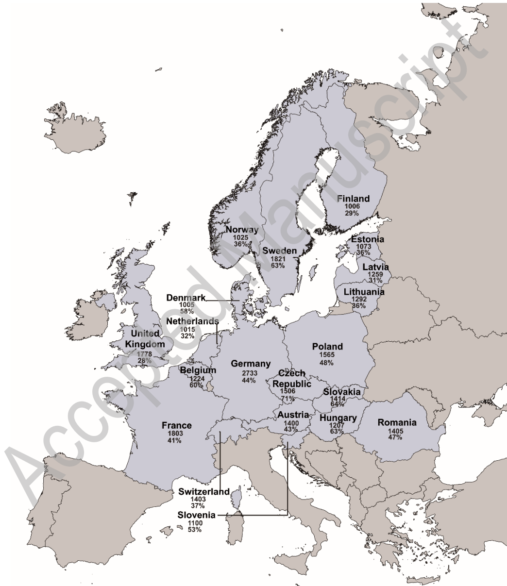
Figure 1. Twenty countries included in multi-country Lyme borreliosis survey in Europe, 2022; the number of respondents (n) and the survey response rate (%) in each country is noted below the country name