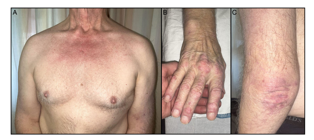
Figure 1: Dermatologic manifestations. patient's dermatologic findings characteristic of dermatomyositis, including heliotrope eruptions and V-sign (A), gottron's papules and capillary abnormalities (B), and gottron's sign (C).