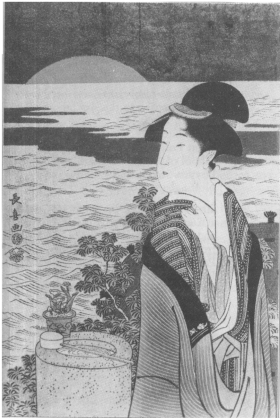
Eishosai Choki, Sunrise on New Year's Day 1790s Colour Woodcut, signed British Museum