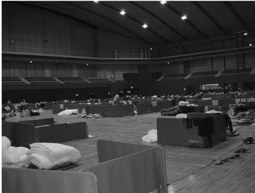
Evacuees Were Housed in the Main Arena of the Main Building.

isolation room in the Kyudo-jo. Subsequently, we started to triage all febrile patients. By the next day (March 23), which was our last day in charge of the facility, the situation had worsened. We were informed by a physician who worked overnight that another 4 patients were positive for influenza A and had been treated and isolated in the Kyudo-jo.