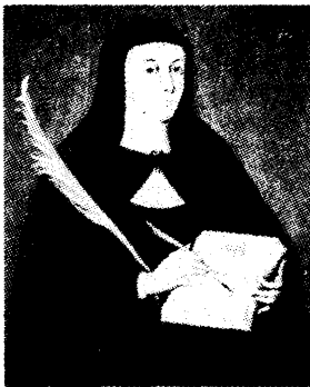
Illustration from UNTOLD SISTERS