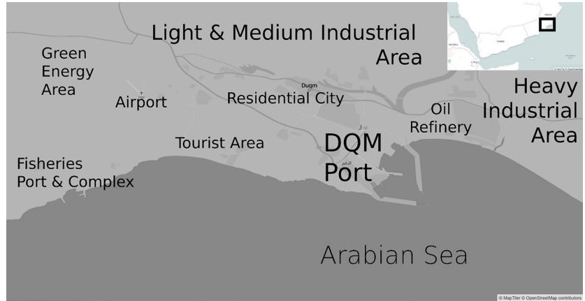
Figure 3.3.2 Implemented and planned zones at the SEZAD