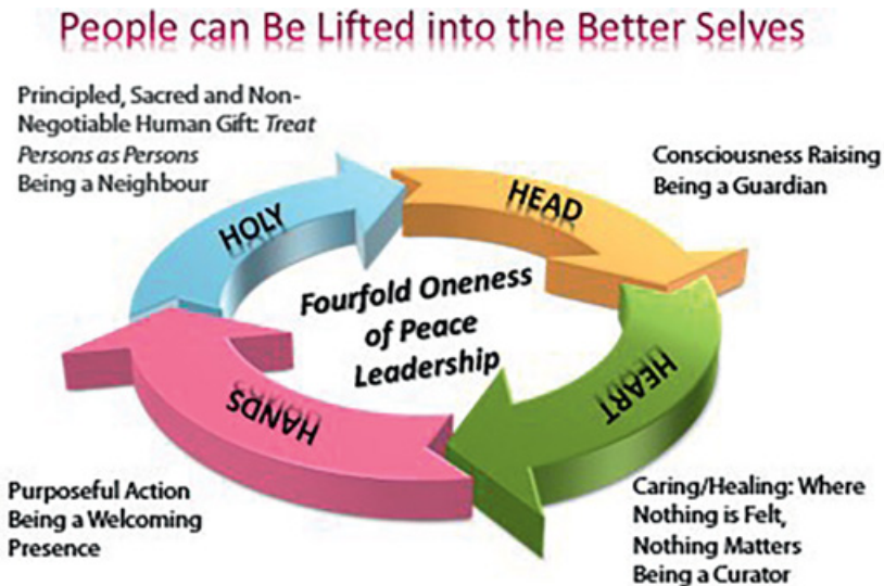
Figure 2 Relationship between four Hs and four ways of being

This is peace dwellers sacred in-between dwelling place. They dwell in-between the spaces of the head (being a guardian), heart (being a curator), hand (being a welcoming presence), and holy (being a neighbour). They each relate to each other and take each other into account in this in-between space rather than