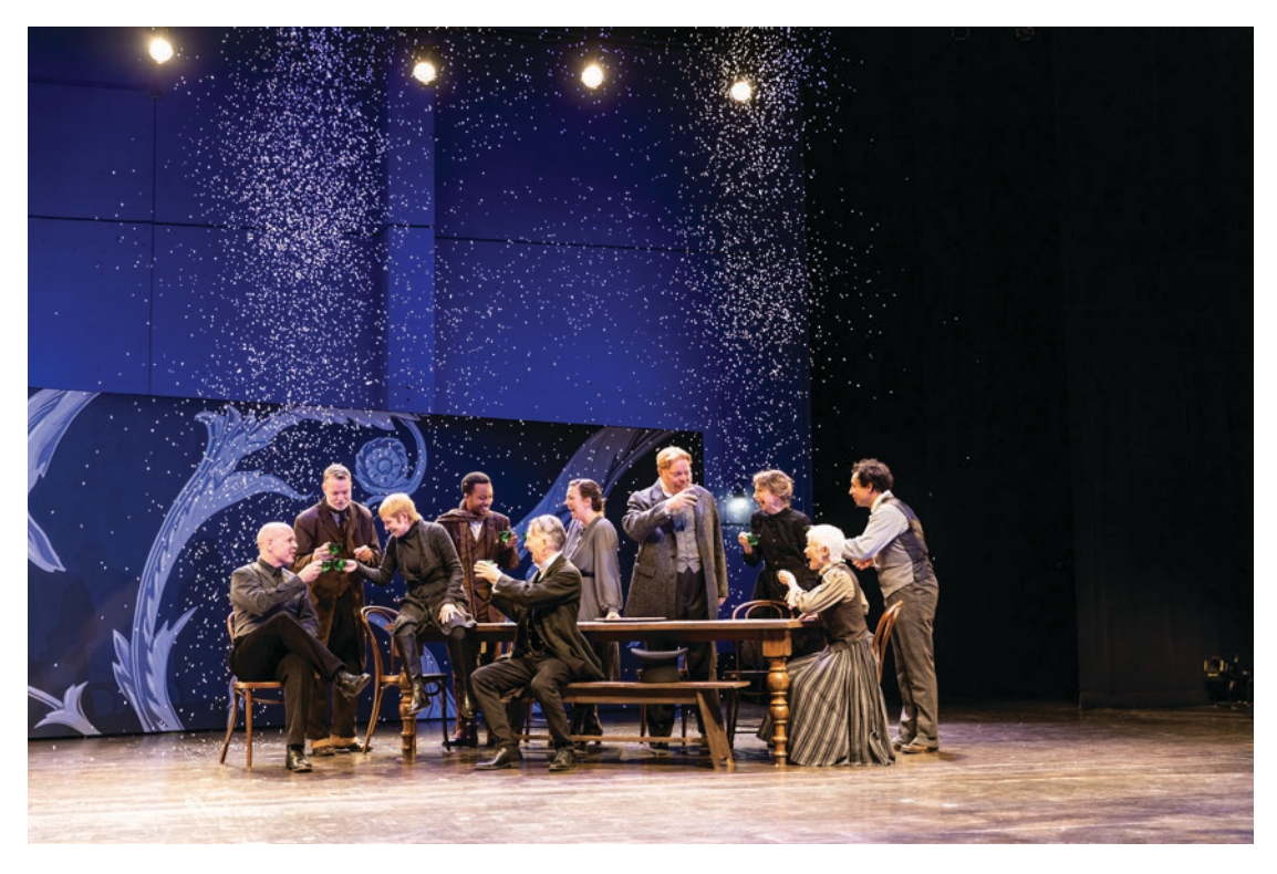
Figure 24. SITI Company toasting their final performance of A Radio Christmas Carol, Fisher Center at Bard College, Annandale-on-Hudson, NY, 2022.