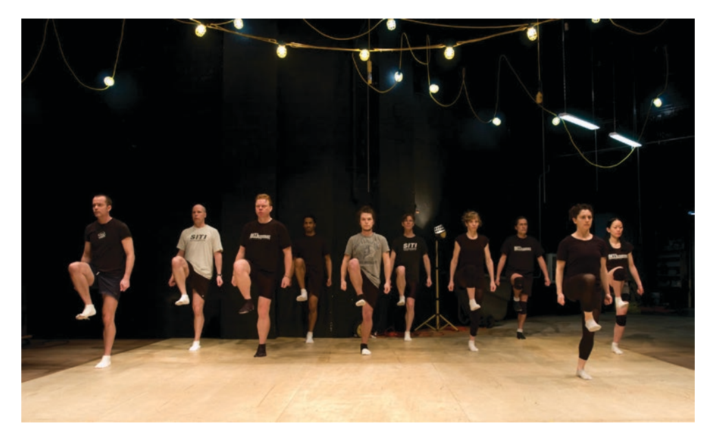
Figure 9. SITI Company training prior to Under Construction, Actors Theatre of Louisville, 2009.

focused on SITI's use of the Viewpoints for both deconstruction and creation, and for staging, but the relationship between Overlie and Bogart was often fraught. At times Overlie stated that she was "sympathetic to the idea that [...] the Six Viewpoints began to change as [Bogart and Landau] worked with them" (1998:38). At other times, Overlie described Bogart's progressive ownership of the Viewpoints as "devastating" (in Bogart 2012:418). Despite the fact that Bogart often explicitly referenced Overlie as she taught, "The Viewpoints" became known as Bogart's creation. In the end, it was perhaps that Bogart referred to her work as "Viewpoints" that was the most difficult for Overlie; in later SITI years, Bogart herself, according to Ingulsrud, said she "should have called it something else" (2023).