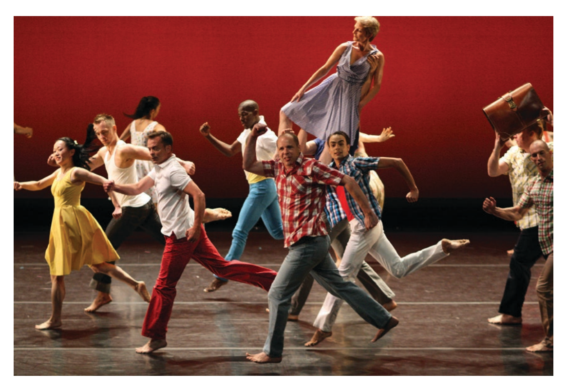
Figure 12. American Document, SITI and Martha Graham Dance Company members. Joyce Theater, New York, NY, 2010.