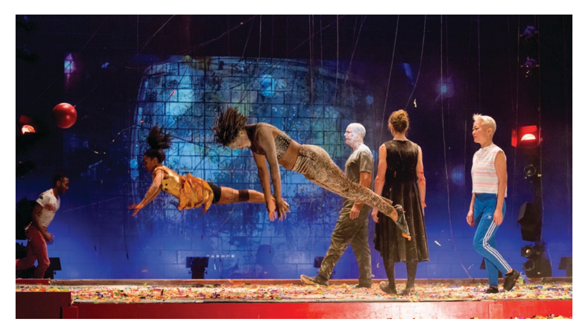
Figure 14. Falling & Loving, SITI Company and Streb Extreme Action. PEAK Performances, Montclair State University, 2019.