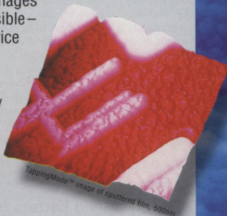
TappingMode™ image of sputtered film, 500nm

Santa Barbara, California, 800-873-9750, 805-899-3380