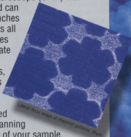
Lateral force image of chemical patterns, 30µm

It's ideal for semiconductors, magnetic media, biomaterials and other demanding samples, with integrated top-view optics and automated stepping for scanning multiple areas of your sample.