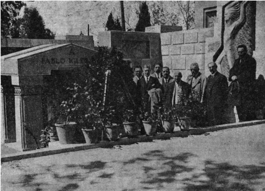
Figure 3. The executive committee of the IFTU at the Pablo Iglesias Memorial in the cemetery of Madrid. Boletín de la Unión General de Trabajadores de España , June 1931.

France, this deployment of the region in musical form represented an evocation of folklore that was understood to be entirely national, without any intention of asserting any particularist identity for the region itself. 39