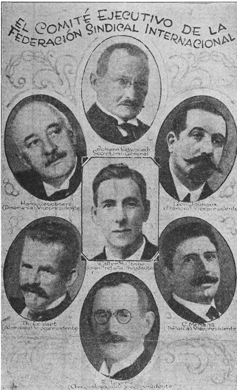
Figure 2. Faces of IFTU leaders published on the front page of El Socialista , 26 April 1931.