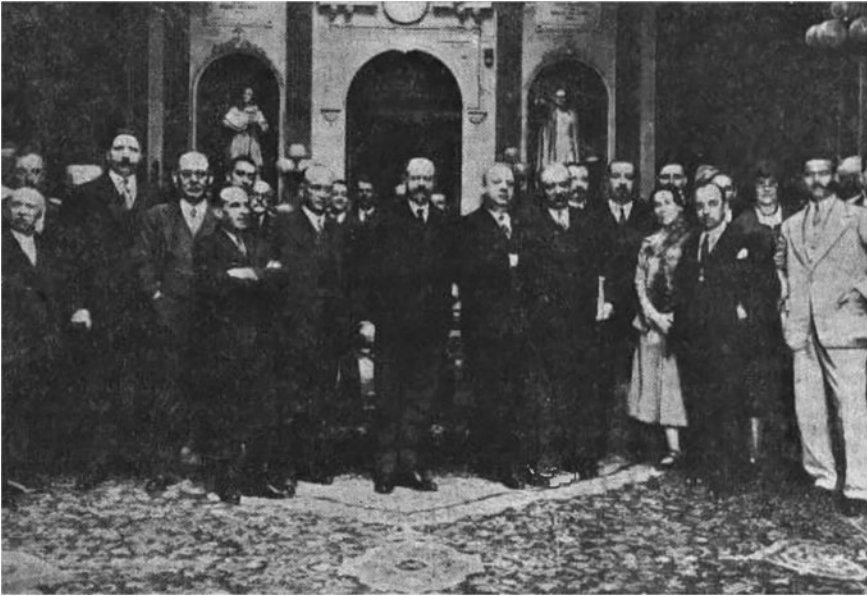
Figure 1. Members of the PSOE and the IFTU at the Senate. El Socialista , 29 April 1931.

Castilian-centric definition of Spain in cultural and linguistic terms. In this way, our study demonstrates not only the deep identification of socialism with Spanish nationalism, and the nation's involvement with internationalism, but also the ethnic and cultural dimension of socialist Spanish nationalism.