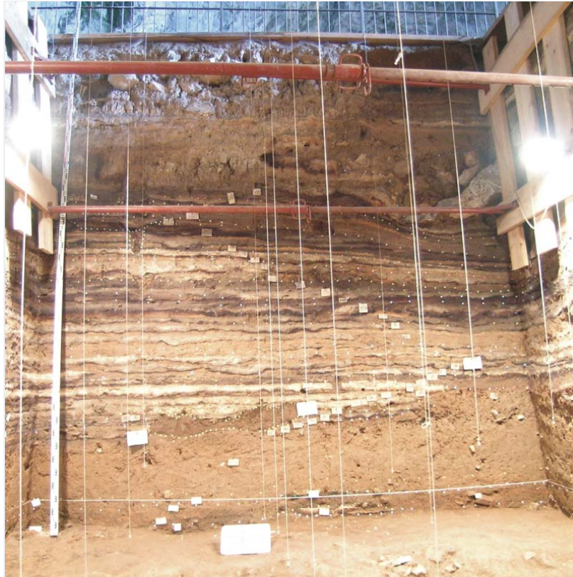
Figure 1 Stratigraphy of the Santuario della Madonna Cave