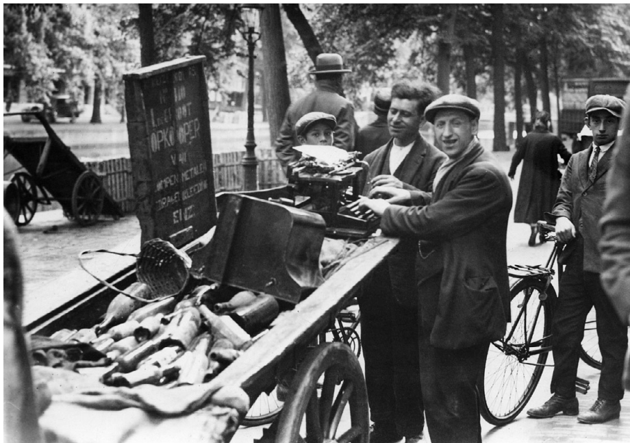
Figure 2. Jewish peddlers dominated the trade of reused materials like this man at the second-hand market Waterlooplein trading bottles, textiles and a typewriter in Amsterdam in 1925. When Germans occupied the Netherlands they were replaced by non-Jewish citizens. Waterlooplein 1925

without compensation grew from 19% in 1941 to 40% a year later. 48 The waste export policy to Germany resulted in the Bureau's bad reputation for what it called 'the foolish, ill-founded anti-propaganda . . . that collected cans are to be reused for the production of guns'. 49 Indeed a resistance movement poster illustrates evidence of opposition to this policy. 'No support for the German war machine. No surrender of metal objects', an illegal resistance poster urged Dutch citizens to fight the occupation by refusing to recycle old material (Figure 3). 50 Bureau officials attempted to counter public resentment, arguing that most waste benefited Dutch factories. 'In those factories, Dutch workers earn 'a decent wage' and through Dutch traders, their products are brought to Dutch families. If there is a truly national interest these days, it is without doubt the act of saving these socially valuable materials.' 51 Although