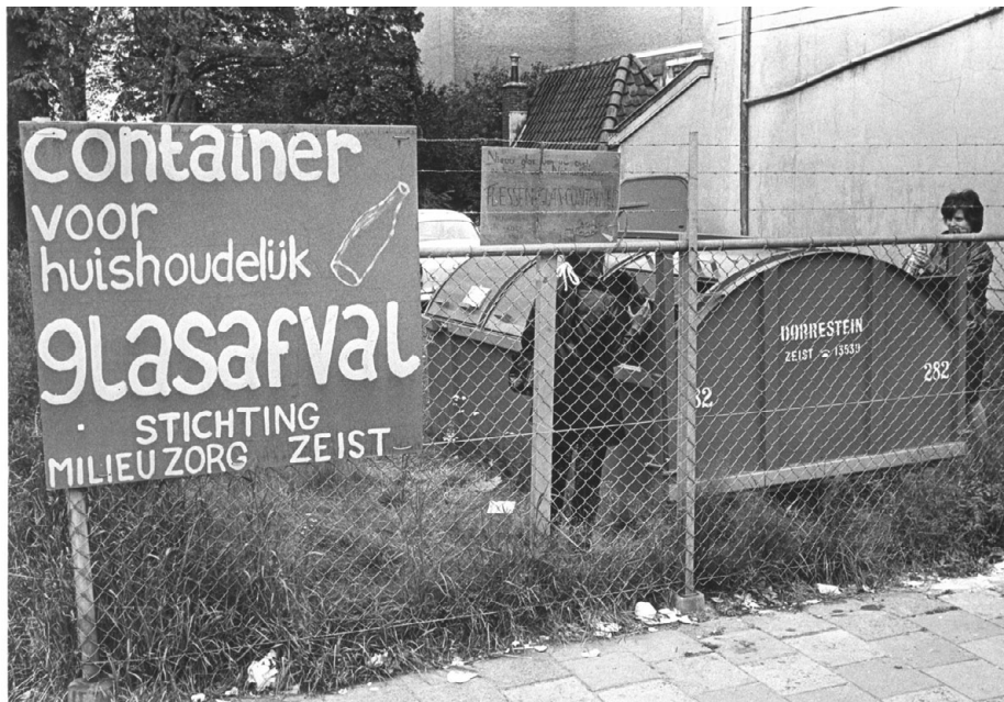
Figure 1. At the initiative of women activists of the Zeist Milieuzorg, the first Glass Recycling Container was placed near the supermarket in Zeist, The Netherlands. De Nieuwsbode , 7 June 1972.