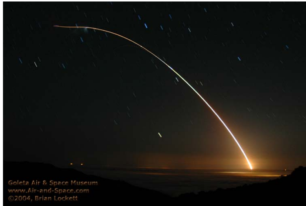
North Korea missile test July 4, 2006

President Barack Obama is now the one to pick up the pieces of a failed strategy that left Pyongyang with a small arsenal of nuclear weapons and a big plutonium reactor still cranking out nuclear fuel. In their discussions with Selig Harrison and others, the North's leaders have now cranked up a maximum position, presumably in anticipation of negotiations with the new administration: they want to keep their weapons, test their long-range missiles, get two light water reactors in return for shutting down the plutonium complex yet again, and they don't care whether the Americans like all this or not, or whether a U.S. Embassy ever materializes in their capital or not. They are nothing if not hard bargainers, and no doubt they will climb down from these maximal positions. But it is unlikely that they will give up the a-bombs that are the residue of Bush's disastrous failures. Can we live with a nuclear-armed North Korea? It looks like we will have to, various hard-line spluttering in Washington notwithstanding. There never was a military solution in Korea, as we should have learned in 1953, and there certainly isn't now. So welcome to the era of benign neglect. Bruce Cumings