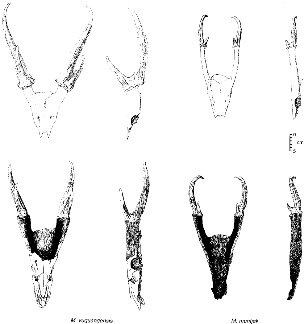
Figure 1. Line drawings of giant muntjac Megamuntiacus vuquangensis and common muntjac Muntiacus muntjak trophies.

giant muntjac's Lao distribution and its population's core area. Nakai-Nam Theun NBCA is the only site where trophies of the large-antlered muntjac outnumbered those of the common muntjac (by a ratio of c. 2 : 1; more than 50 giant muntjac trophies were found in this area). Given the frequency of muntjac tracks and calls, it seems probable that the species is relatively common in this area. In other areas where both species occur, there were typically less than half as many giant