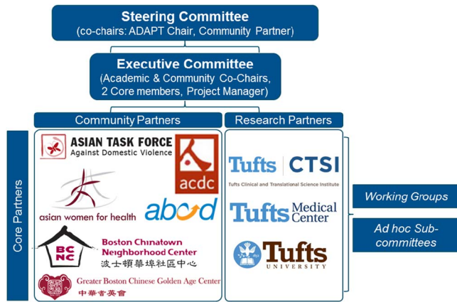
Fig. 3. Addressing Disparities in Asian Populations through Translational Research (ADAPT's) governance structure.

expand its engagement with diverse stakeholders and bring in new members while honoring the time and commitment made by those who have been involved for a long time. Monthly Steering Committee meetings have continued since ADAPT's inception. The meetings are open to anyone interested, and the attendance includes both members of the Steering Committee, other (affiliate) members, trainees, and interested faculty and community.