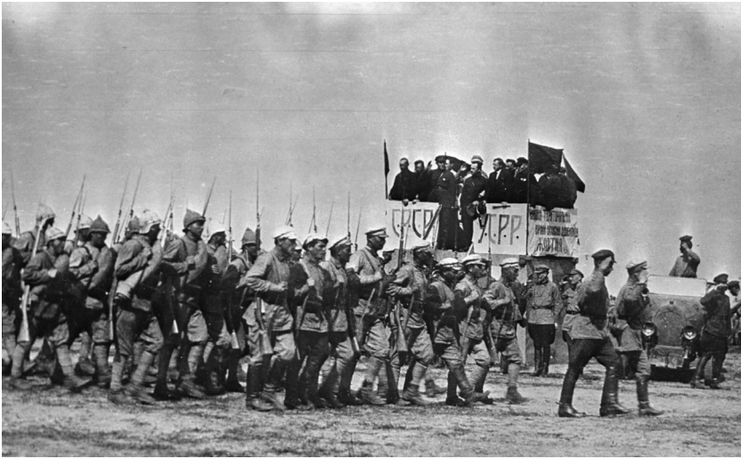
Troops of 46th Territorial Division parade on the eighth anniversary of the October Revolution in November 1925. For financial rather than military reasons the territorial divisions were the mainstay of the Red Army during the late 1920s and early 1930s.

leadership. Where cadre forces were insufficient to guard against attack by a substantial enemy force, territorial units were difficult to mobilise and deploy to border areas in the event of increased international tension. The disruption to the economy of mobilising troops for an unspecified period without provision for their absences was just one issue hampering their mobilisation in a situation that stopped short of war. This factor, on top of the limits to what could be achieved through limited and sporadic training for units that would lack the same cohesion as regular formations if required at short notice in the event of a crisis, meant that regular divisions now had increased appeal not only to the Red Army, but also the civilian leadership. Nonetheless, the military system established in 1925 that obliged many Soviet men of call-up age to serve in either the regular or territorial forces would survive until 1939.