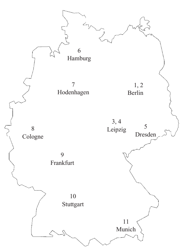
Fig. 1. Main study sites of Germany: 1. Zoological Garden Berlin, 2. Tierpark Berlin-Friedrichsfelde, 3. Zoological Garden Leipzig, 4. Game Park Leipzig, 5. Zoo Dresden, 6. Tierpark Hagenbeck, Hamburg, 7. Serengeti Safaripark Hodenhagen, 8. Zoological Garden Cologne, 9. Zoological Garden Frankfurt, 10. Wilhelma Stuttgart, 11. Tierpark Hellabrunn Munich.

The ticks were examined for the presence of spirochetes by darkfield microscopy (DFM) and by