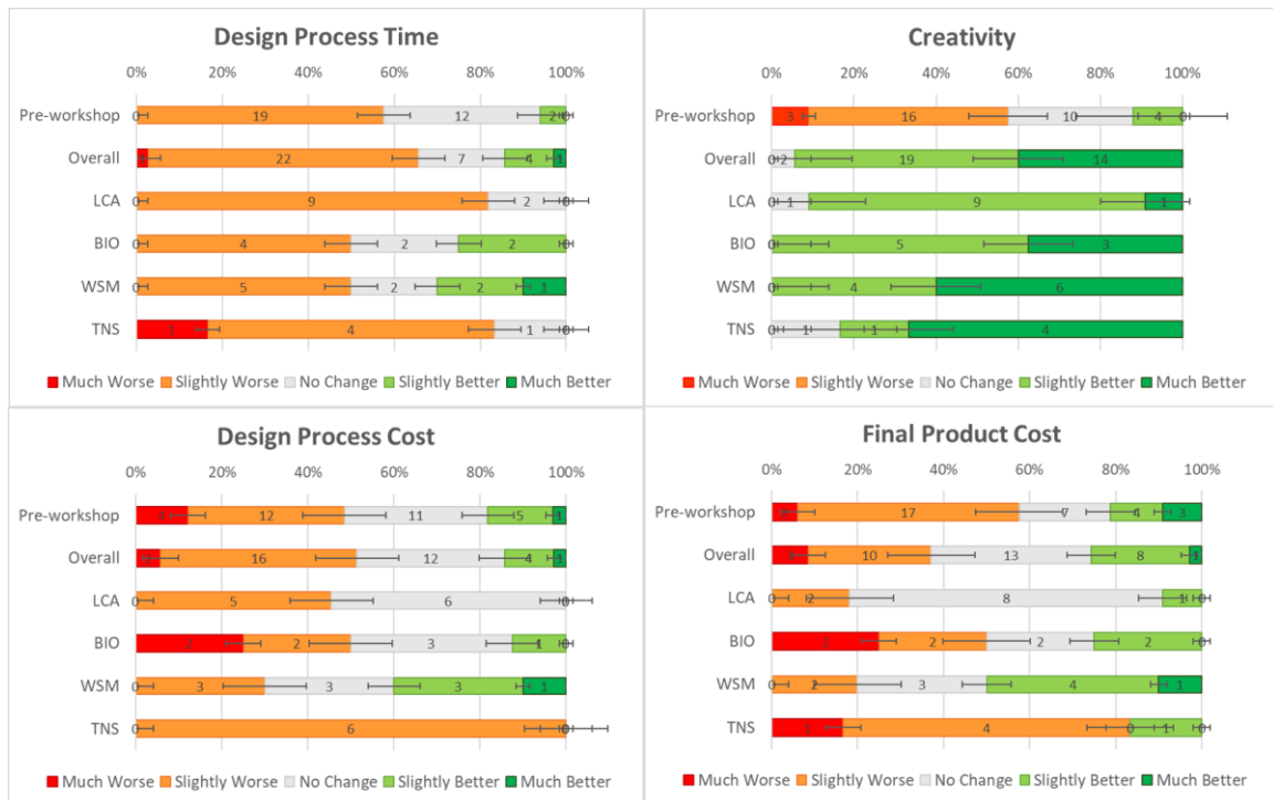
Figure 2. Shift in perceptions across design methods (1)