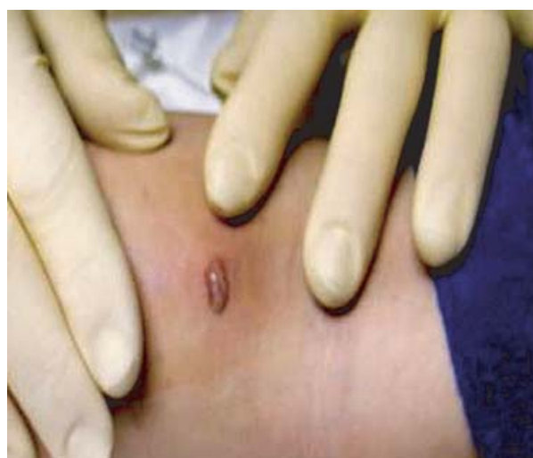
Fig. 2. Illustration of an abscess present on a case-patient's forearm.

reported before May 2004 (Fig. 1). Twenty-two other clinically diagnosed SSTIs not requiring I&D were also identified but are not represented in the figure. The median age of case-patients was 13 years (range 2–54 years); 17 (71%) were male. Crowded living conditions were also observed among case-patients (Table 1). All confirmed and probable case-patients presented clinically with abscesses (Fig. 2), 18 (75%) with lesions located below the waist. Lesions typically appeared initially as a deep, erythematous, tender nodule. Within the first 24 h of appearance, the majority of lesions were painful, typically out of proportion to the soft-tissue changes. By 48 h, a clearly defined deep abscess, ~4 mm below the skin surface formed and was amenable to I&D. A clinician performed I&D on 15 of 17 confirmed case-patients. No hospitalizations were required. Nineteen case-patients (79%) received antimicrobial agents (e.g. penicillin, fluoroquinolone, cephalosporin and macrolides) during the 12 months preceding a MRSA SSTI for