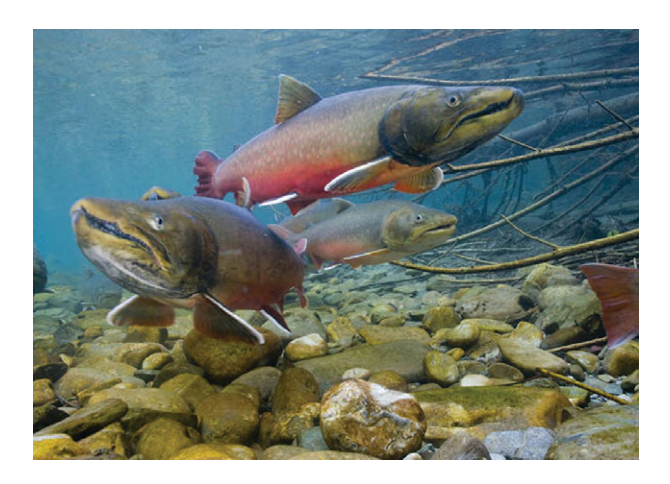
Figure 9.8 Threatened bull trout ( Salvelinus confluentus ) are apex predators in the cold streams and rivers of the western United States. Climate change threatens these fish by decreasing snowpack and stream baseflows, increasing summer water temperatures, and inducing more frequent flooding from rain-on-snow precipitation events.