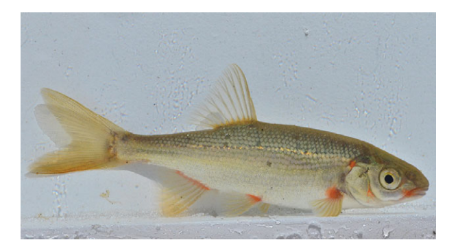
Figure 9.2 A substantial portion of the increase in new freshwater fish species is from the discovery of cryptic species. For example, a genomic analysis of California roach ( Hesperoleucus spp.) revealed a complex hierarchy that included two genera, six species, four subspecies, and several distinct population segments. Pictured is a roach ( H. symmetricus navarroensis ) from the Russian River in breeding colours (Baumsteiger and Moyle, 2019).

Second, there has been a substantial increase in new freshwater fish species that are part of complexes of cryptic species (Adams et al., 2014). Cryptic species are species that are not recognised because they are hidden under the names of widely distributed, well-recognised species; they often appear morphologically identical to the described species, while they are genetically quite distinct (Bickford et al., 2007). The increasing use and decreasing costs of molecular studies such as DNA barcoding and other genomic techniques continues to reveal new cryptic species and this trend will likely continue. For example, Ramirez et al. (2017), using DNA barcoding, detected potential cryptic diversity within 10 nominal