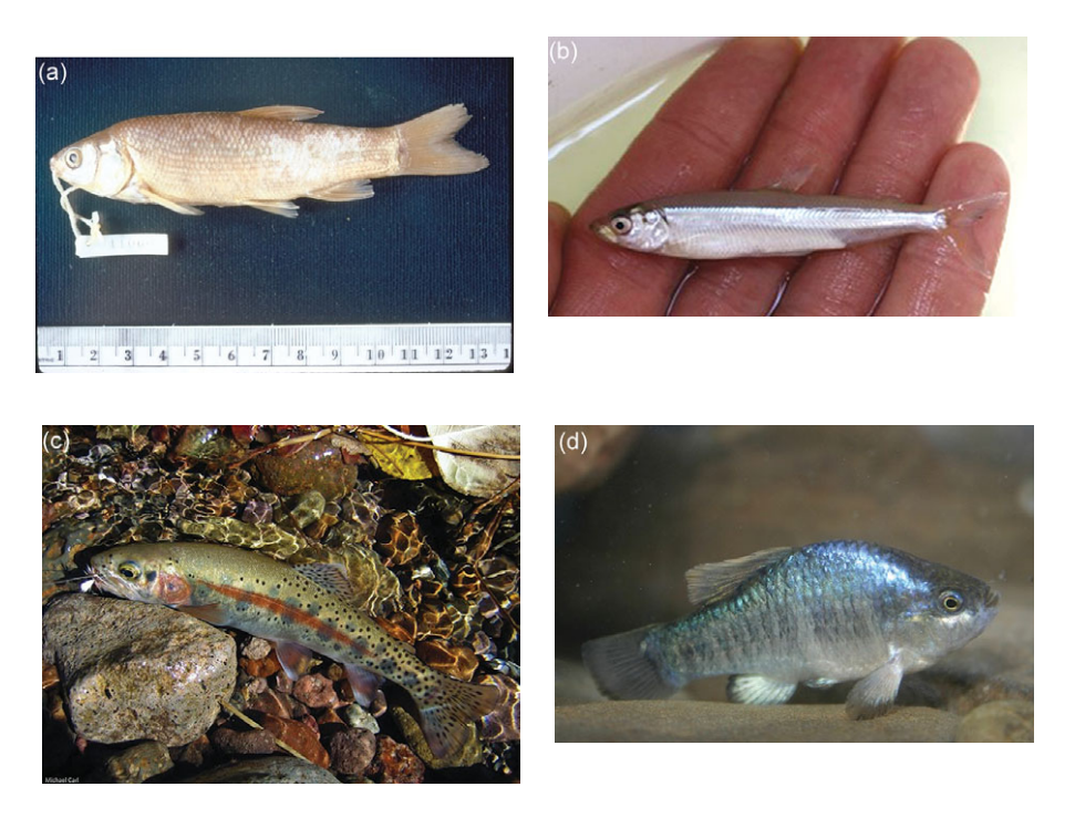
Figure 9.1 Examples of extinct and threatened California freshwater fishes. (a) The endemic, extinct, thicktail chub, Gila crassicauda , was historically one of the most abundant fish in lowland aquatic habitats of Central California. (b) Delta smelt, Hypomesus transpacificus , a critically endangered member of the Osmeridae. (c) McCloud River redband trout, Oncorhynchus mykiss stonei , an endangered member of the Salmonidae from Trout Creek, California. (d) The endangered Owens pupfish, Cyprinodon radiosus , a small endemic fish that is restricted to isolated springs in arid southeastern California.

future. The situation in California likely reflects the future of freshwater fishes in many other geographic areas of the world. Using the comparatively well-studied fish fauna of California as background, in this chapter we discuss the following topics:<sup>1</sup>