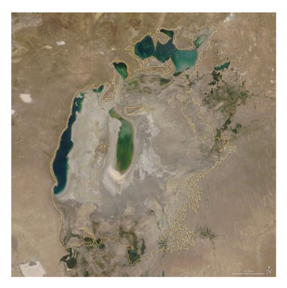
Figure 9.3 The Aral Sea was once the fourth largest freshwater lake in the world. Water diversions for the expansion of agriculture have greatly reduced its size. A 2018 NASA image of the Aral Sea shows the drastic contraction of the sea since 1960 (yellow lines depict 1960 shoreline).

for IBIs is that the abundance and diversity of native fishes is an excellent indicator of 'healthy' habitat. However, in some highly disturbed waters, native fishes are integrated into fish assemblages that also contain many non-native species, forming novel ecosystems shaped by human presence (Moyle, 2014). Most aquatic habitats of the world today are disturbed to some degree, and thus are increasingly divergent from historical conditions (Figure 9.5). Climate change is accelerating this process, which is leading to increased homogenisation of fish faunas around the world. See Closs et al. (2015) for further discussion of these habitat alteration issues.