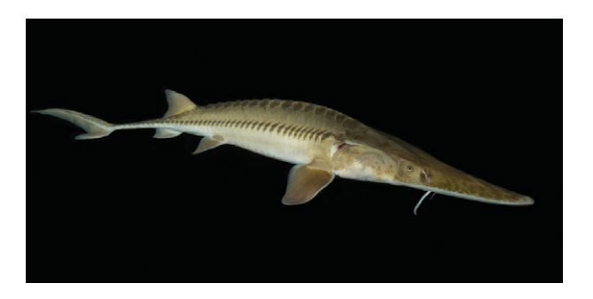
Figure 9.12 The pallid sturgeon ( Scaphirhynchus albus ) is native to the Mississippi and Missouri River systems, USA, and is considered endangered. Dam construction and dredging have altered its habitat, preventing the sturgeon from reproducing.

Because sturgeons and paddlefishes are so valuable, large aquaculture operations exist for some species, mainly to provide caviar. Their value and adaptability to captive conditions create strong incentives to rear species in captivity, despite the high costs of