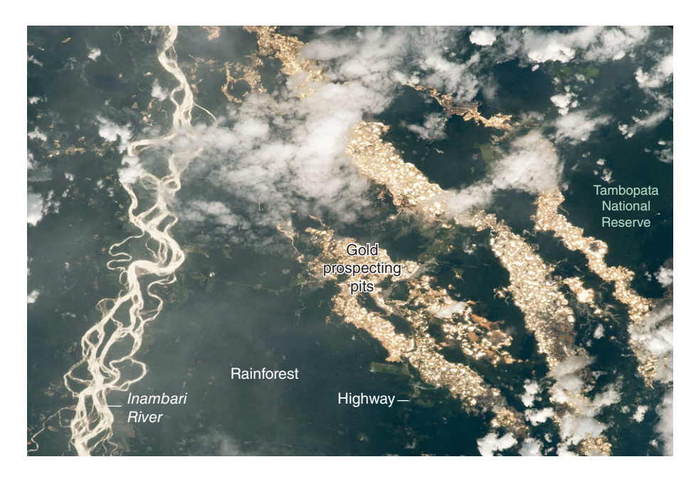
Figure 9.5 Gold mining pits in the Amazon rainforest of eastern Peru result in forest clearing, sedimentation, and the discharge of toxic substances into rivers and wetlands with devastating impacts to freshwater fishes.

Figure 9.4 The Three Gorges Dam constructed on the Yangtze River is the largest hydroelectric dam in the world. It has severely affected the fish fauna of the river. (a) The 2000 photo depicts river conditions during construction of the dam. (b) The 2006 photo shows the dam following completion.