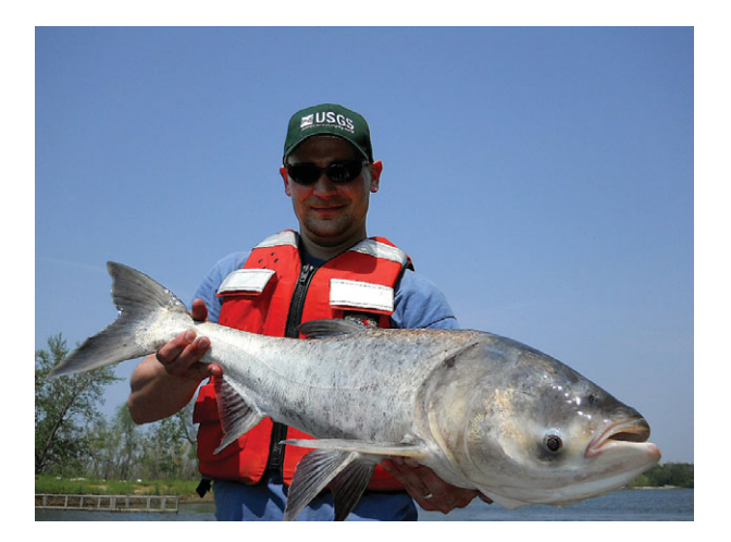
Figure 9.6 Bighead carp ( Hypophthalmichthys nobilis ) are a non-native species established in rivers in the midwestern USA, but have not yet invaded (as of 2021) the Great Lakes. They are plankton-feeding fish that can become extremely abundant, altering food webs and displacing native fishes.

Most waterways around the world support non-native species of fishes. Species with global distributions due to human intervention include brown and rainbow trout (cold waters), common carp, goldfish and mosquitofish (temperate waters), and Mozambique tilapia and guppy (tropical waters). In highly altered habitats (e.g. reservoirs), alien fishes suppress native fish populations through predation, competition or disease. In California, there are over 50 species of alien fishes and about 130 species of native fishes (Moyle and Marchetti, 2006). Generally favoured in altered habitats, non-native species show an increase in abundance as climate change accelerates habitat change and increases competition for water between people and fishes (Moyle et al., 2013). This is a pattern occurring throughout the world. The result will be increased dominance of local fish faunas by a few highly tolerant species, many non-natives (Figure 9.6).