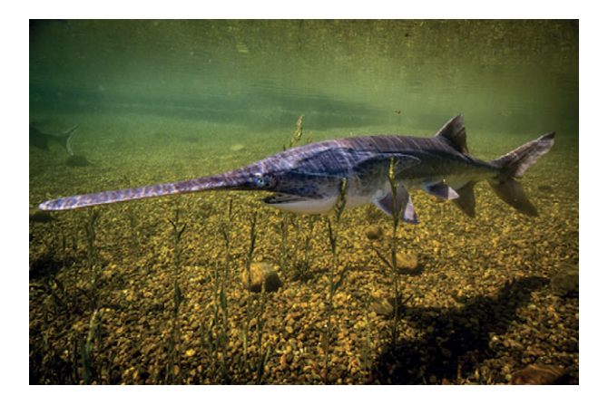
Figure 9.11 The world's largest fishes are some of the most endangered. The American paddlefish ( Polydon spathula ) is native to the Mississippi River drainage, USA, and its conservation status is vulnerable to pollution, overfishing and other factors. Its closest relative, the Chinese paddlefish, recently was declared extinct.

The cumulative effects of all major causes of fish decline discussed in this chapter have severely affected sturgeon and paddlefish populations (Haxton and Cano, 2016). However, global sturgeon populations have suffered most from two factors: illegal