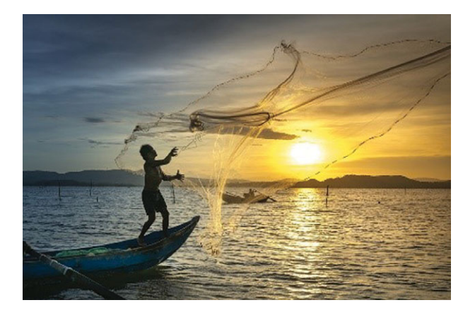
Figure 9.7 Fishing with a cast net in lower Mekong River basin. Fisheries in the Mekong are an important source of protein for millions of people.

Rising sea levels, prolonged droughts, massive floods, warmer waters (see Barbarossa et al., 2021) and increasingly distressed human populations are all predictions of global climate change. All of these events will adversely impact freshwater fish abundance and diversity, although a few hardy, widely introduced alien species (e.g. common carp) will no doubt thrive (Moyle et al., 2013) (Figure 9.8). A significant factor affecting native fishes is the predictable human reaction to take actions to fight the changing conditions, which further decreases habitat for fishes. Such actions include construction of additional hardened infrastructure (dams, levees, sea walls, etc.), increased exploitation of remaining fishes, increased diversion of freshwater, invasion of salt water into historically freshwater areas and general degradation of freshwater habitats. Much depends on how and when we let such seemingly inevitable changes take place and how conservation fits into the planning. However, the ever-present desire of most governments for such big projects does not bode well for the fishes.