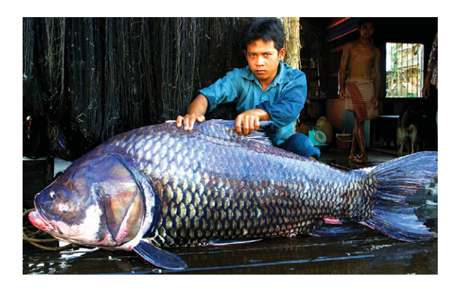
Figure 9.9 The giant barb or Siamese carp, Catlocarpio siamensis , is the largest carp/barb (Cypriniformes) in the world and is endangered by dams and overfishing. This giant barb was caught on the Mekong River.

<sup>a</sup> Includes species, subspecies and varieties, and subpopulations