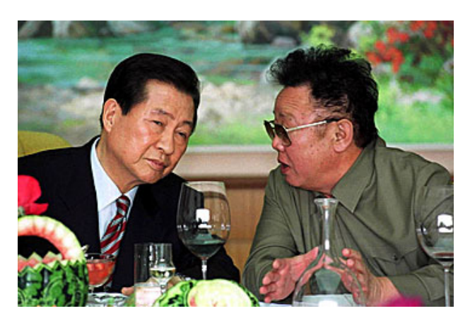
Kim Dae-jung and Kim Jong-il on June 15, 2000

From all available indications, it is clear that the North does not want to talk to the South, unless the conservative South Korean government accepts the two summit agreements of June 15, 2000 and October 4, 2007. The Rodong article alleged that "the negation" of the two agreements "means denying the ideology and system in the DPRK and seeking confrontation."