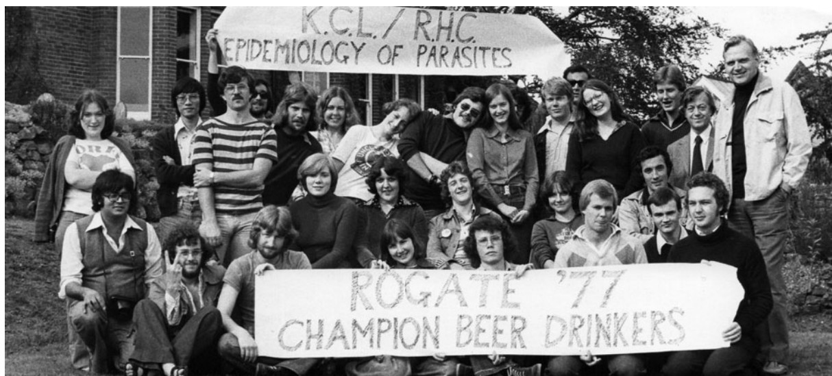
Fig. 3. Parasite ecology and epidemiology field course, Rogate, Sussex in 1977.