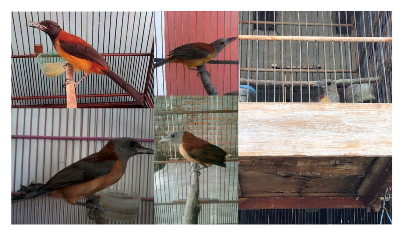
Figure 1. From top left, clockwise: Hooded Pitohui Pitohui dichrous , offered for sale by a seller in Jakarta (December 2023; asking price US$72); variable pitohui, offered for sale by seller in Bekasi, West Java (October 2023); Northern Variable Pitohui Pitohui kirhocephalus for sale at Satria bird market in Denpasar, Bali (January 2020), Northern Variable Pitohui (lacking tail) offered for sale online for US$66 (first posted February 2018), with the seller based in Sidoarjo, near Surabaya in East Java; Northern Variable Pitohui, Jakarta (first posted March 2017), with an asking price of US$346.