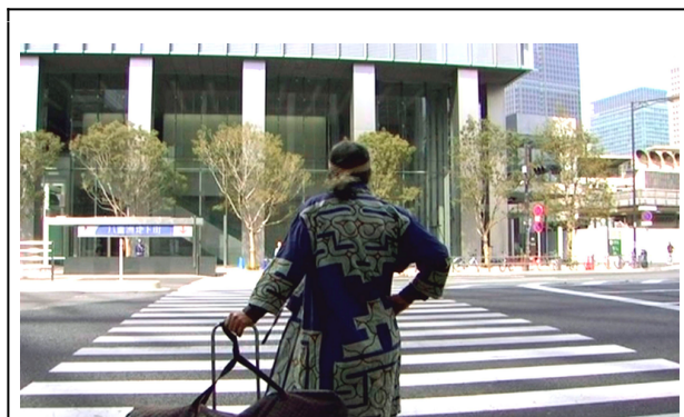
© TOKYO Ainu Film Production Committee: No part shall be reproduced or reused with permission of the Committee.

representations and emphasises the existence of Japan's indigenous people within its capital city. The film charts the urban migration of Ainu elders from Hokkaido to Greater Tokyo; and, while preserving their voices for future Ainu generations, it also documents the contemporaneous reality of urban indigeneity lived by them, their children and grandchildren in the Kanto region today.