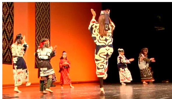
Ainu children perform Sicocoy (dance celebrating an abundant year).