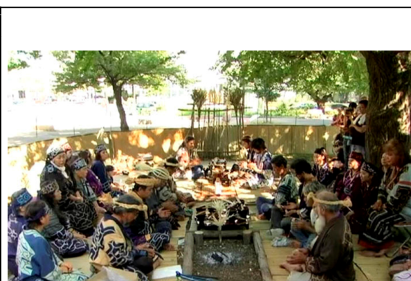
An icarpa ceremony in commemoration of the five Ainu who died when forced to attend the Hokkaido Native Training School has been held annually in Shiba Park, Tokyo since 2003.

There have been Ainu within the Kanto for more than one hundred years. In 1872, four years after the Meiji Restoration and three after the new government founded its Hokkaido Development Commission to annex the island, a Hokkaido Aboriginal Training School was established in Minato-Ku, Tokyo and thirty-eight Ainu were forcibly brought from their northern homes to study at the school, five of whom died there. Within Zojoji Temple 11 in present-day Shiba Park, the school tested educational methods that the Meiji government would later use to assimilate young Ainu in Hokkaido to Japanese culture.