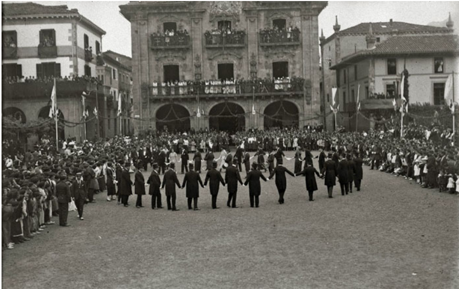
Figure 1. Celebration of the International Congress on Basque Studies by the Basque Studies Society in Oñati, Gipuzkoa, February 11, 2017.