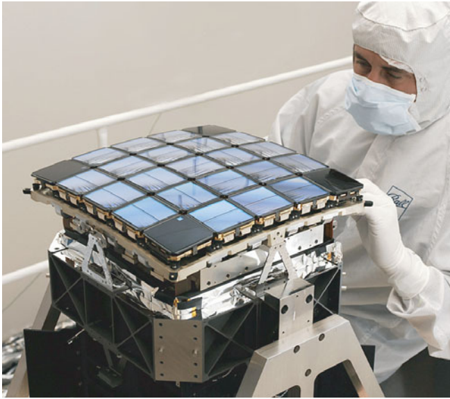
Figure 1. Completed flight focal plane for Kepler with 42 science CCDs and 4 fine guidance sensor CCDs in the corners. The science CCDs are thinned, back-illuminated, and AR-coated with 1024 by 2200 pixels each with two readouts per CCD for a total of 84 science outputs. The pixels are 27 micrometers with a plate scale of 3.98 arcsec/pixel. The FOV is 13.9° side to side.