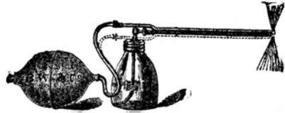
PRICE 5s. 2d.

The Post-Nasal Atomiser provides the laryngologist with a ready means of applying medicaments to the larynx, pharynx, and post-nasal regions. By an ingenious device the spray can be directed either perpendicularly or laterally.