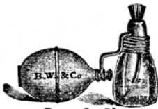
PRICE 3s. 5d.

AN oily solution of medicaments for application to the nasal, naso-pharyngeal, and laryngeal mucous surfaces, is often much to be preferred to an aqueous, spirituous, or glycerine solution. An absolutely tasteless, odourless, and neutral substance like “Paroleine,” which, apart from its solvent qualities, has unique healing and soothing properties of its own, is specially fitted for use with volatile substances such as Carbolic Acid, “Eucalyptia,” Terebene, Pinol, etc., and since it adheres to the surface for some time after application, it acts as a protective for inflamed and irritable mucous membrane, and secures a longer exposure of the affected parts to the influence of the dissolved medicament.