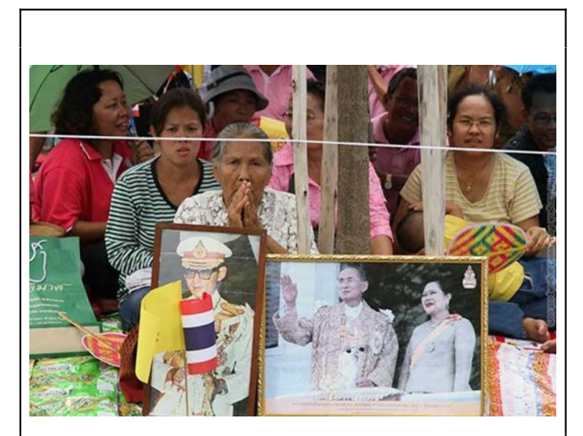
Bangkok Post photo of citizens in Ayutthaya for May 4, 2012 royal visit

It is significant that the ceremony at Thung Makham Yong attracted Thais of different stripes and from all walks of life, rural and urban, north and south, red and yellow, civilian and military, capitalists and formerly communist-leaning activists. It harks back to the unifying role the monarchy has played at certain divisive junctures in the past, particularly in October 1973 and in May 1992.