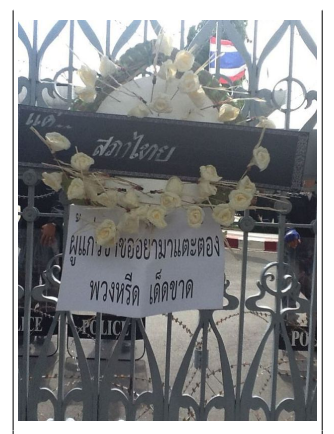
Symbolic wreath on Thai Parliament gate adjacent to yellow shirt gathering

The speeches were peppered with the same kind of crowd-pleasing juicy hot stuff one hears at red rallies, full of bombast and hyperbole, but the crowd itself struck me as being considerably more relaxed, united and sure of itself than the red shirts were the other day. Maybe it's the difference of commuting from the suburbs instead of the countryside. Maybe it's the difference of sitting near a verdant zoo where public bathrooms are available compared with sitting in a naked intersection with no street level amenities other than an overwhelmed McDonalds. In any case, the yellow shirt gathering was more subdued in tone, in all senses of the word, than the last edgy red massing at Ratchaprasong.