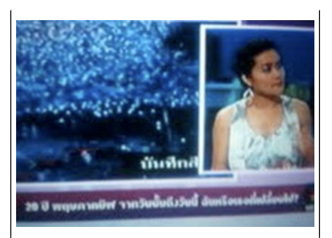
Diva talking about Black May

Though the presentation by the three Divas was not without insight and charm, it was using history for political effect. It should come as no surprise that a staunchly pro-monarchy reading of the coup of '32 is also in circulation, in which the coup is construed as a canny anticipation of, and pre-emptive assertion of, the Westerneducated King Prachidhipok's own will, that is to say it is the sort of thing he would have done by other means if he could have, and has ever since been used to bolster his reputation as a liberal and democracy-minded leader.