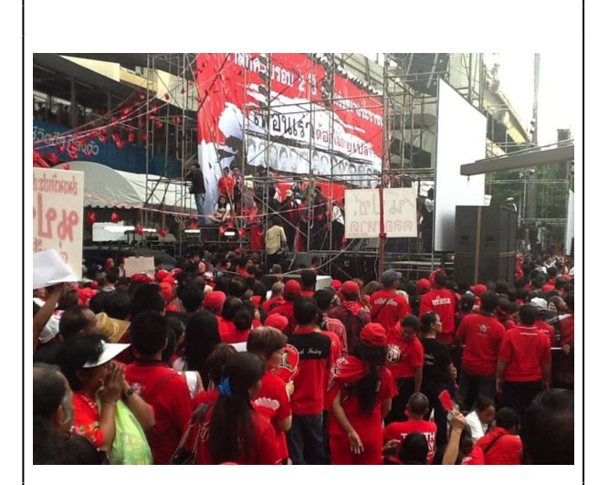
The red stage at Ratchaprasong remembering "friends who did not die in vain"

Finally, there was no mistaking this for anything but a red rally; it was characterized by an impressive degree of crowd coordination and color coordination across a mass of people some forty thousand strong. Not only were the hallmark red T-shirts everywhere in evidence, but an abundance of matching accessories such as face paint, red shoes, red bandannas, scarlet ribbons, polka dots, and tacky plastic clappers were also in evidence. There was even a puppy dressed in a cute red outfit.