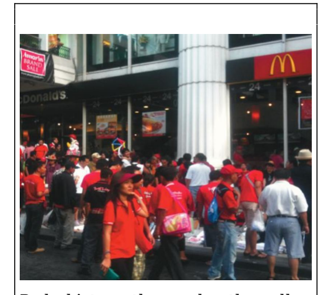
Red shirts gather under the yellow arches

Nation, Religion and King, a trinity traditionally lauded as pillars of Thai society, had been elevated to a quasi-spiritual level during the war against communism, as if the epitome of a singularly Thai essence. Yellow shirt manipulation of this trope becomes all the more clear when put side by side with red. Ever since the rise of the Soviet Union and People's China, along with satellite regimes in Vietnam and Cambodia, red has been all but synonymous with communism. Prince Sihanouk famously described the Pol Pot group as the "Red Khmer," or Khmer Rouge, and the name stuck. Elsewhere, red flags, red stars and red headbands endowed the wearer with powerful associations, even to the point of intimidation, with revolutionary communism.