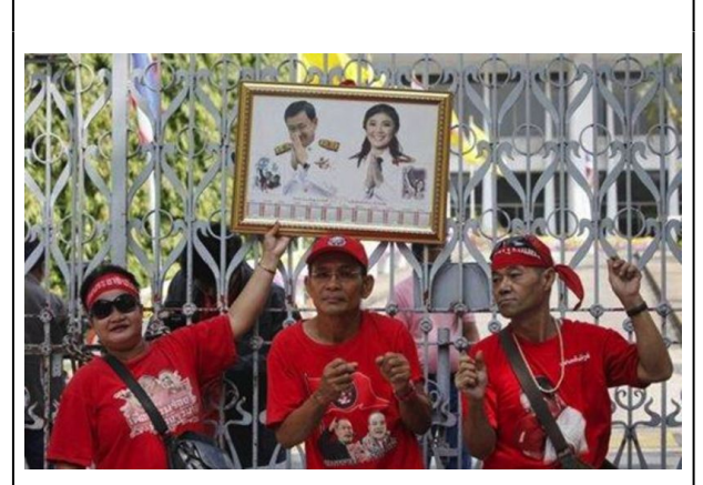
Some red shirts cast the Shinawatras as the saviors of Thai democracy

Red shirts are regularly subjected to accusations of being anti-monarchy, a perception fueled by swings between effusive praise and the harsh rhetoric of a vocal republican fringe within the movement. Whether this bold minority speaks for many or most red shirts is hard to know - free discussion about how Thais really feel about the monarchy is in part constrained by a selfcensorship born of familiarity and fondness, and in part due to the all-too-real fears of being accused, and possibly imprisoned, due to overzealous application of the lese majeste law but in any case the republican wing of the red shirts is likely to find itself increasingly at odds with the administration of Yingluck Shinawatra, whose eagerness to strike a balance and make amends with the palace has come at the price of stifling the more radical tendencies of the people who elected her.