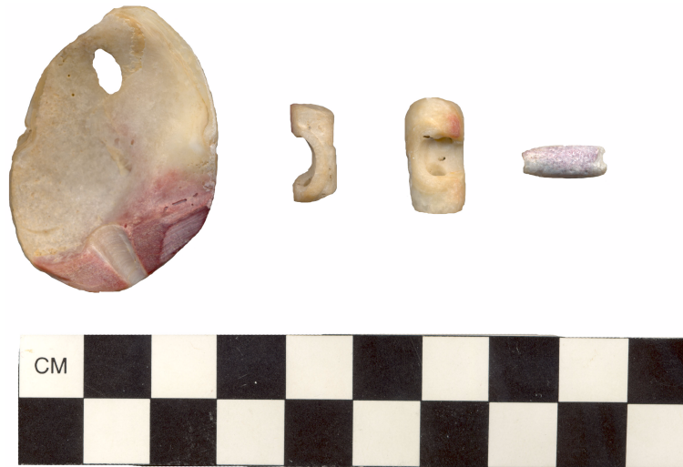
Figure 2 Giant rock scallop ornaments and beads from CA-SMI-608, CA-SMI-657 ( n = 2 ), and CA-SMI-162 (left to right).

dominated by large red abalone shells in a yellow-tan alluvial paleosol. Braje (2007) obtained 14 C samples from the midden exposures (Table 1) and excavated a 100-L bulk sample and a 2 × 1 m test unit in the eastern gully wall of the northernmost locus.