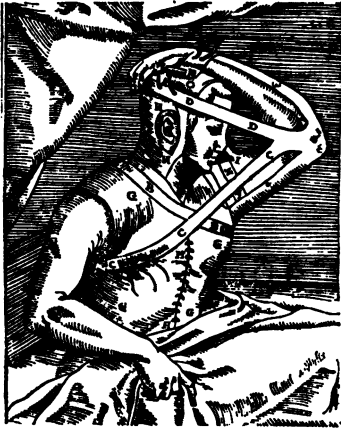
A sixteenth-century nose graft