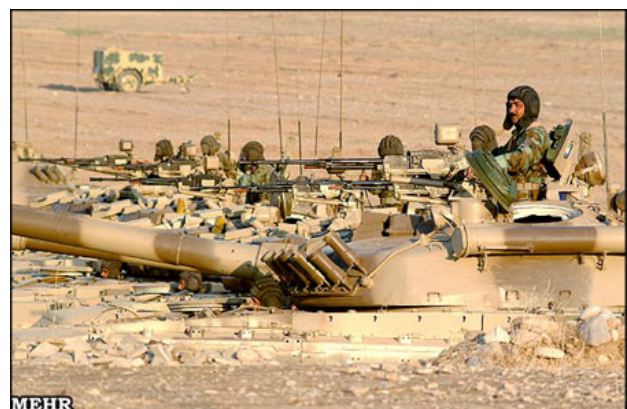
Iranian Missile Exercise

What is now occurring in the Middle East reveals lessons just as relevant in the future to festering problems in East Asia, Latin America, Africa and elsewhere. Access to nuclear weapons, cheap missiles of greater portability and accuracy, and the inherent limits of all antimissile systems, will set the context for whatever crises arise in North Korea, Iran, Taiwan...or Venezuela. Trends which increase the limits of technology in warfare are not only applicable to relations between nations but also to groups within them--ranging from small conspiratorial entities up the scale of size to large guerilla movements. The events in the Middle East have proven that warfare has changed dramatically everywhere, and American hegemony can now be successfully challenged throughout the globe.