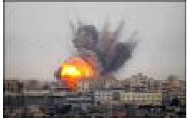
Israeli missiles target Beirut

soon likely to be in Palestinian hands as well. At least 20 of the tanks were seriously damaged or destroyed.