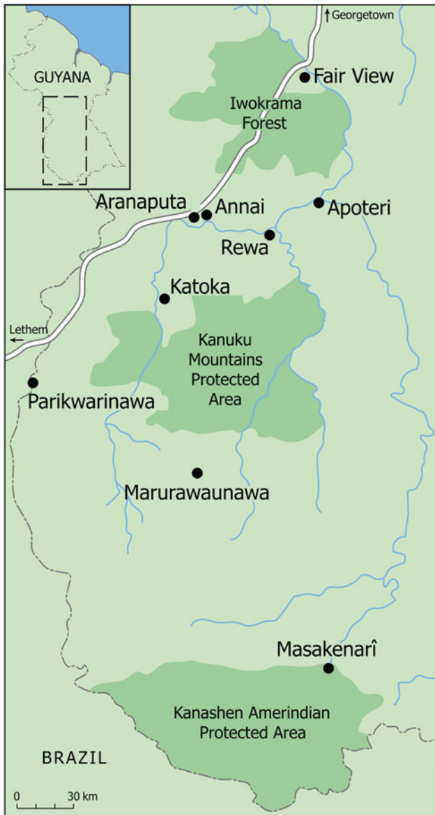
FIG. 1 Guyana, showing the locations of the communities that we worked with in this study and the associated protected areas.