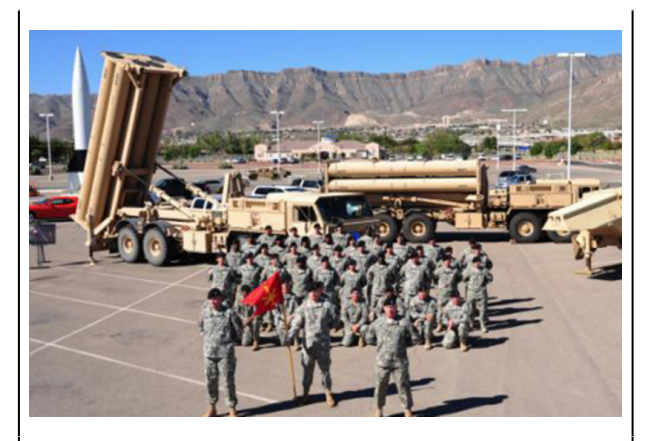
Fig. 5. Red Dawn 2 Redux? Lockheed Martin product page for Terminal High Altitude Area Defense (THAAD).

As critics have pointed out, "There is...nothing 'defensive'" about any of this, least of all the "B-52 and B-2 nuclear strategic bombers," which the Obama administration put into play in early 2013 on the Korean peninsula.<sup>28</sup> Indeed, such "flights were designed to demonstrate, to North Korea in the first instance, the ability to conduct nuclear strikes at will anywhere in North East Asia."29 Yet, even as the North Koreans have had to hunker down, with "single-minded unity," in preparation for the prospect of a David-and-Goliath showdown with the United States, the true audience of the U.S.-directed dramaturgy of war styled as the "pivot" policy unquestionably has always been China.