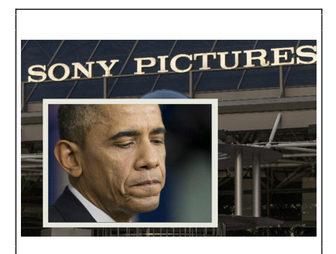
Fig. 2. Obama Vows to Respond to Cyberattack on Sony at December 19, 2014 Year-End Press Conference.

administration over The Interview must be dated back to the production stage. Having screened a rough cut of the film at the State Department, Sony appears to have queried officials, including Special Envoy for Human Rights in North Korea, Robert King, specifically about what it worried was the over-the-top violence of the head-exploding assassination scene of Kim Jong Un (played by Randall Park). Harboring no such qualms, the State Department gave the green light.