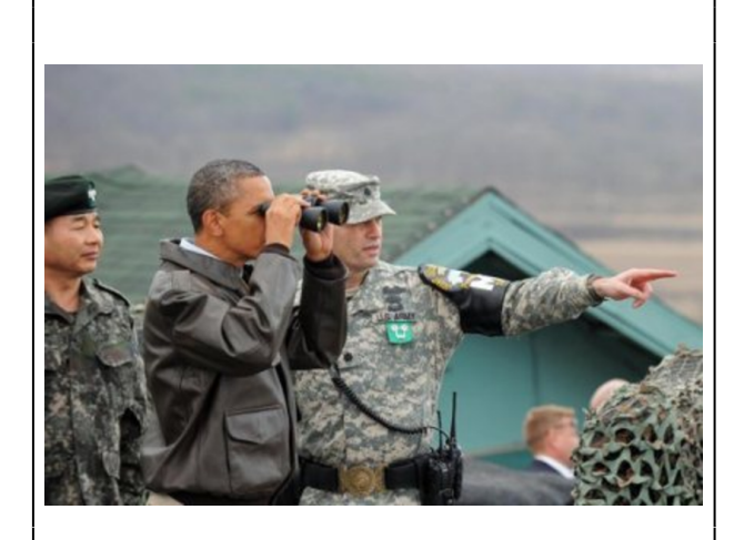
Fig. 1. Obama Peers into North Korea from What He Calls "Freedom's Frontier" on March 25, 2012.

Korea's consolidation as a state, registers little, if at all, within the United States where the Korean War is tellingly referred to as "the Forgotten War." Indeed, few in the United States realize that this war is not over, whereas no one in North Korea can forget it.