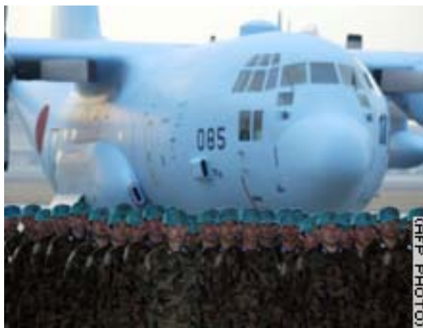
An ASDF C-130

it, seems to have begun in the fall of 2003 at about the same time as the GSDF deployment to Samawa. The main operations are conducted from Ali al-Salim Air Base in Kuwait, and involve about two hundred men and three C-130 transport planes. An additional ten ASDF officers serve at the U.S. Air Force Central Command, which is apparently in Qatar. It is not clear what the ASDF planes are actually transporting, but they have denied rumors that their cargoes include ammunition for U.S. forces.