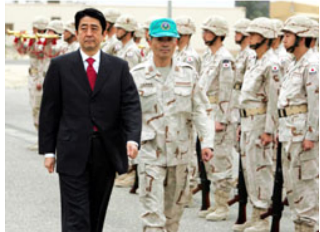
Former Prime Minister Abe Shinzo reviews ASDF troops in 2007

Significant Japanese newspaper reports on the ASDF mission did not begin appearing until April 2006 when the Asahi Shinbun ran a five-part series that had clearly gained official cooperation. A year later, then-Prime Minister Abe Shinzo allowed himself to be photographed inspecting the troops during his April-May 2007 tour of the Persian Gulf.