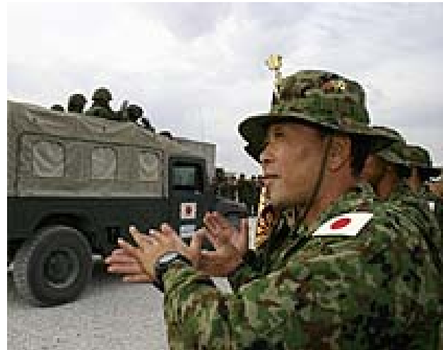
GSDF Troops in Iraq

On July 19, 2006, the final elements of the Ground Self-Defense Forces (GSDF) mission rolled across the border between Iraq and Kuwait. The 2 1/2 year mission in Samawa ended without the deaths of any GSDF member on Iraqi soil -- although it was indirectly related to the deaths of several Japanese civilians. As this watershed event was taking place, the future policies of the Japanese government remained shrouded in uncertainty. Was this the effective end of Japanese support to the post-Saddam Iraqi government? Or was it simply the beginning of a new phase?