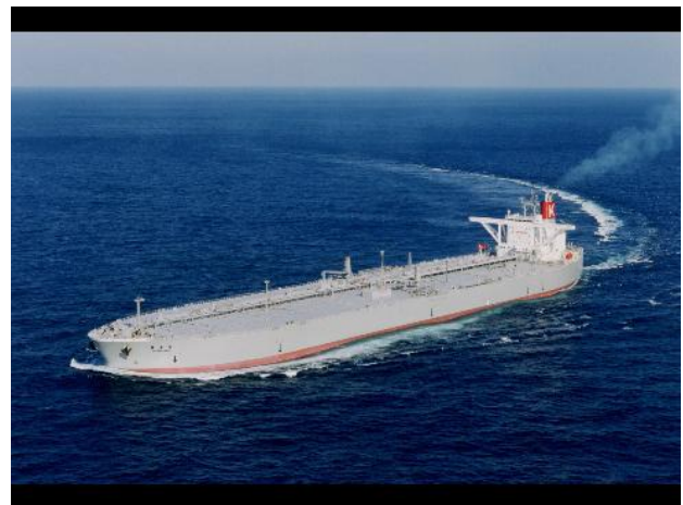
A Japanese oil tanker

Still, Japanese oil companies did get involved. In April 2005 the Japan Petroleum Exploration Company signed a technical assistance agreement with the Iraqi Oil Ministry. The Arabian Oil Company followed suit a couple of months later in June 2005. These moves were well-understood by all parties as being preliminary steps toward much deeper Japanese involvement in the Iraqi oil industry in the future.