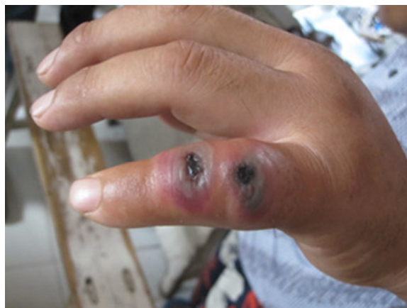
Fig. 2. Typical skin lesions (vesicles with central black eschar) on the little finger of the index case that developed several days after he slaughtered and butchered a sick cow on 25 July 2012.

The index case was notified to public health officers on 2 August 2012 by an alert physician in a tertiary infectious disease specialist hospital, who raised the diagnostic possibility of cutaneous anthrax when examination revealed typical skin lesions on the patient's little finger, i.e. vesicles with a central black eschar (Fig. 2). Before this, the index case had visited different types of hospital (local village, township, county) between 29 July and 1 August, and was