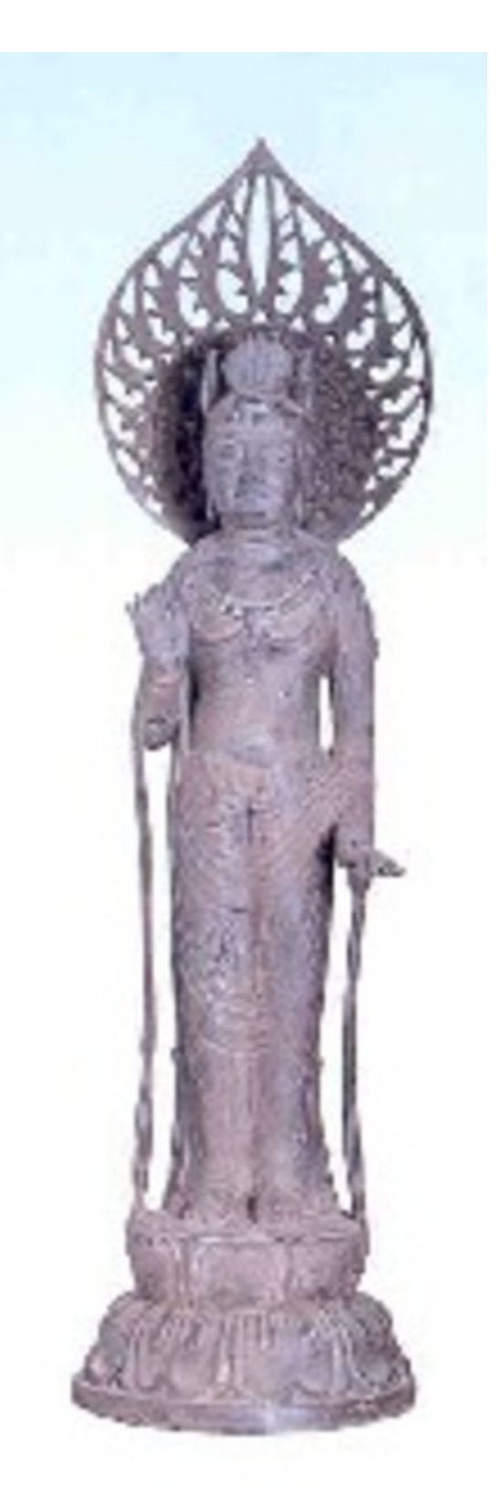
Chiran Kannon temple Chiran Kannon statue