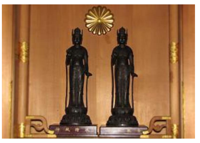
Setagaya Tokkō Kannon-dō Two Setagaya Kannon statues