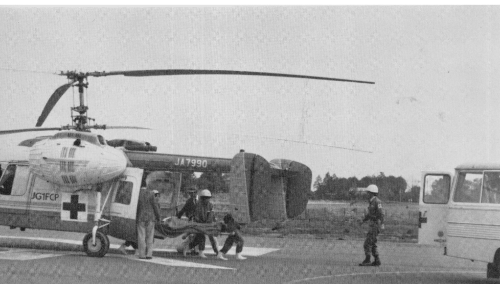
1977 : A helicopter of the Japanese Red Cross flying corps carries injured persons.