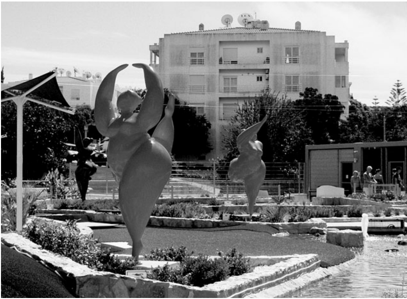
Figure 5. Sculptures by Karl Heinz Stock, Pro Putting Garden, Lagos, Portugal.

a variety of positions, and some of them had their hands and arms tied. 17 Although the remains were extensively studied by Portuguese scholars, no memorial was established at the site. Instead, an underground parking lot now occupies the location of the waste dump, on top of which sits the Pro Putting Garden Lagos, a picturesque landscaped mini-golf course. Featuring fountains and bridges, the scenic park is decorated with colorful sculptures (Figure 5) by artist Karl Heinz Stock (who is identified as white), representing female bodies joyfully dancing over one of the oldest European sites where the remains of enslaved Africans associated with the Atlantic slave trade were discarded. But tourists are only informed about this unpleasant long chapter of Portuguese history when they visit the “slave market,” a museum center created in collaboration with the UNESCO Slave Route Project in 2016. The museum, occupying a seventeenth-century building constructed in the area where the presumed first European slave market existed, comprises a modest permanent exhibition telling the story of the Atlantic slave trade and slavery in Lagos.