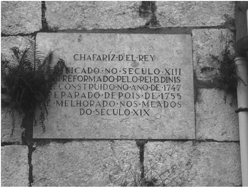
Figure 6. Chafariz-del-Rey, Lisbon, Portugal.

Despite Portugal's continuing refusal to face its history of slavery and its central involvement in the Atlantic slave trade, over the last decade black citizens have played an important role in making Lisbon's slave past visible in the public space. In December 2017, under the leadership of the Association of Afrodescendants (an anti-racist organization) and through the city's participatory budgeting system, Lisbon residents voted for a project to create a memorial to the victims of slavery. In June 2019, the city council sanctioned the creation of the memorial along with a visitor center and initiated the selection process of its design and implementation proposal. The memorial will be constructed at Campo das Cebolas, an area associated with the presence of enslaved Africans in Lisbon, 230 meters from the Chafariz-del-Rey (Figure 6), the same portrayed in the sixteenth-century painting (Figure 1).