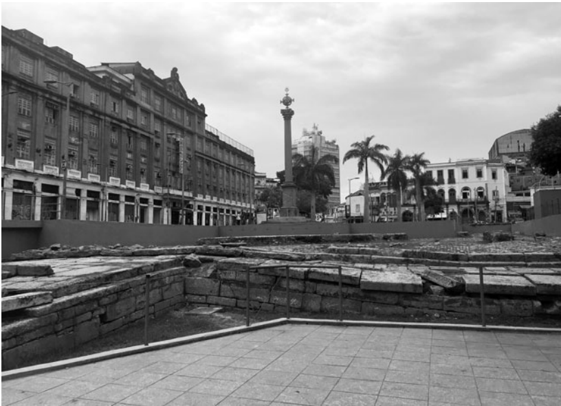
Figure 3. Valongo Wharf, Rio de Janeiro, Brazil.