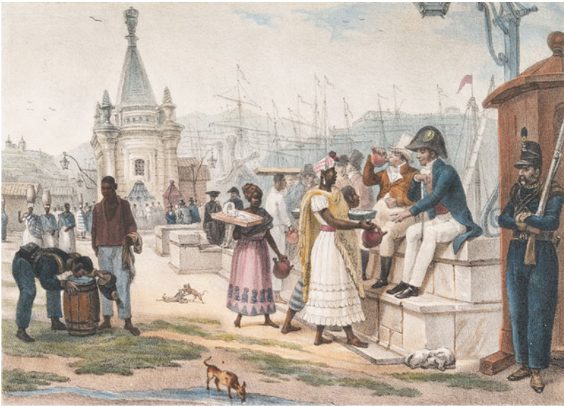
Figure 2. “Les rafraîchissements de l’après dîner sur la place du palais” [After-dinner refreshments in the Palace Square]. Jean-Baptiste Debret, Voyage pittoresque et historique au Brésil (Paris, 1834–1839), plate 9.