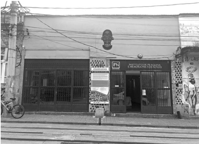
Figure 4. Façade of the Cemetery of New Blacks, Rio de Janeiro, Brazil. Photograph: Ana Lucia Araujo, 2018.

ceremonies, and spectacles of capoeira. 15 Despite these developments, the Valongo area remains negligible compared with most other Rio de Janeiro's tourist sites, and many locals are not aware of its historical importance. Yet, its presence is a permanent reminder of the role of slavery in Rio de Janeiro, which will be hardly erased again from public view.