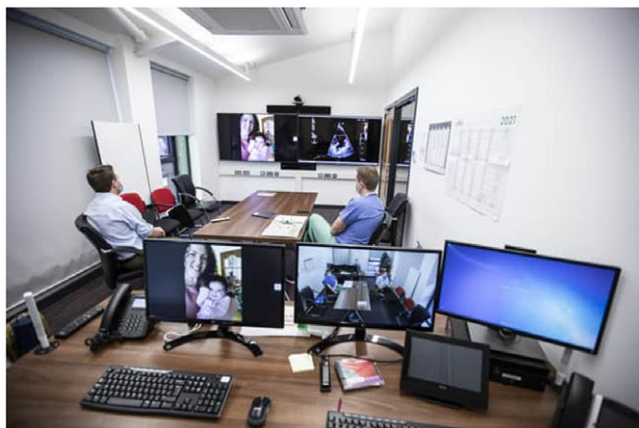
Figure 1. Parent and child engaging in remote consultation (RC).